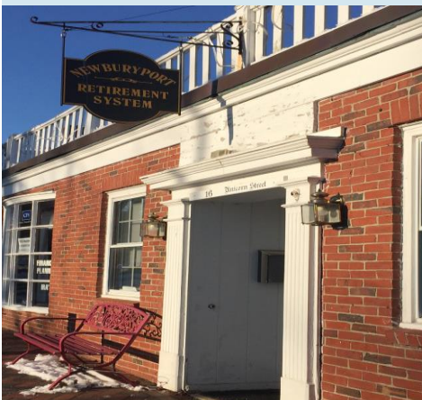
Retirement Office, 16 Unicorn Street

The exemption provided in the legislation will allow those retirees to continue working part-time in various public health, medical and other important public service jobs without having to worry about going over the allotted 960 hours per year or the income restriction and the threat of a penalty. It should be noted that the exemption does not apply to those working under a disability retirement.